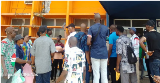
Members of Nigeria Labour Congress (NLC) and Trade Union Congress (TUC) picketing Ibadan Electricity Distribution Company (IBEDC), over hike in electricity tariff, in Ibadan... yesterday

While commending the efforts of the Lagos, Edo, Ekiti, Benue and Adamawa Commands of the Agency for jobs well done in the past week, Chairman/Chief Executive Officer of NDLEA, Brig. Gen. Mohamed Buba Marwa (Retd) assured that officers and members of the Agency will continue to work with local government partners to ensure that the scourge of substance abuse and illicit drug trafficking is brought to the barest minimum in Nigeria.