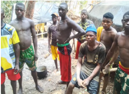
Some illegal miners at one of the mining sites in the