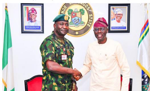
L-R: Chief of Defence Staff, General Christopher Musa exchanging greetings with Governor of Lagos State, Mr. Babajide Sanwo-Olu, during his courtesy visit to the Governor, at the Lagos House, Marina, Lagos... yesterday