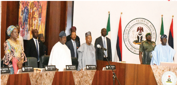
L-R: Head of Civil Service of the Federation, Mrs. Folashade Yemi-Esan; Secretary to the Government of the Federation, Senator George Akume; Vice President Kashim Shettima and President Bola Tinubu, during the Executive Council Meeting at the Presidential Villa, in Abuja, yesterday